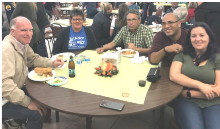
(Top left) SMS alumni & school families at the Oktoberfest Bratwurst Dinner. (Bottom left) "The Harbor's Wurst Bier Band" entertains at the Bratwurst Dinner.