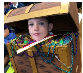
SMS students show off their Vocabulary Parade words and matching costumes.