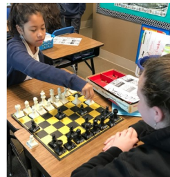
(Top right) Students learn and compete in the newly formed SMS Chess Club.