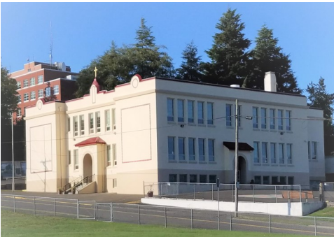
The newly painted exterior of St. Mary School.

The other area to get an update this summer was the school building exterior. As anyone from Grays Harbor knows, wind and rain love to find their way into cracks and crevices, especially the 93-year-old stucco exterior of the school. In order to keep the elements at bay, Pacific Coast Painting first pressure washed the entire building and repaired deteriorating stucco. The building was then sealed with a marine grade sealant and a new coat of paint.