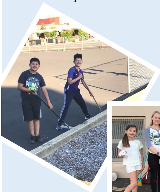
St. Mary School students and family members gathered before the start of the school year to clean up around the school campus.