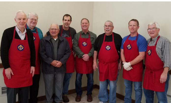
Members of the Joseph S. Novak Council of the Knights of Columbus. The group donated $1,800 to offset school flood costs.

The Joseph S. Novak Council of the Knights of Columbus at St. Mary Parish then stepped forward with a donation of $1,800 to pay off the remaining balance of the deductible.