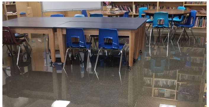
A broken water main left several inches of water in the St. Mary School library and preschool rooms last June.

The cloud that appeared this past June took the form of a broken water main that unleashed several inches of water into the school basement. The silver lining came forth immediately through ServPro technicians who dried out and then cleaned the basement, and over the next few months through individuals and groups who offered financial support. During the summer, the local Catholic parishes in Grays Harbor took up a special collection that raised $3,200 of the $5,000 goal to offset the school's insurance deductible.