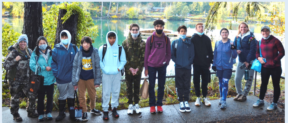
The eighth-grade class and chaperones at Leadership Camp