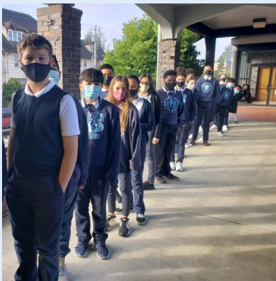
Students returned for the weekly school Mass for the first time in 18 months.