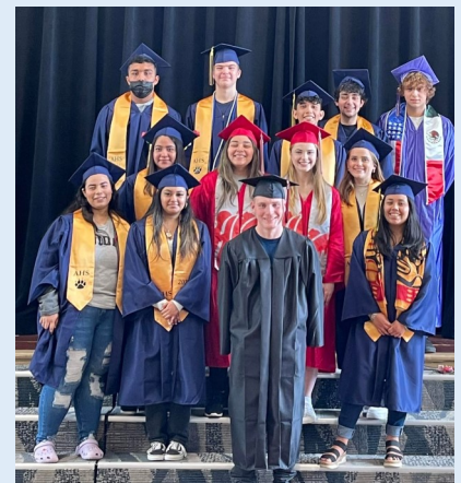
▲ The SMS Class of 2018 returned as high school seniors to impart their wisdom to current students.