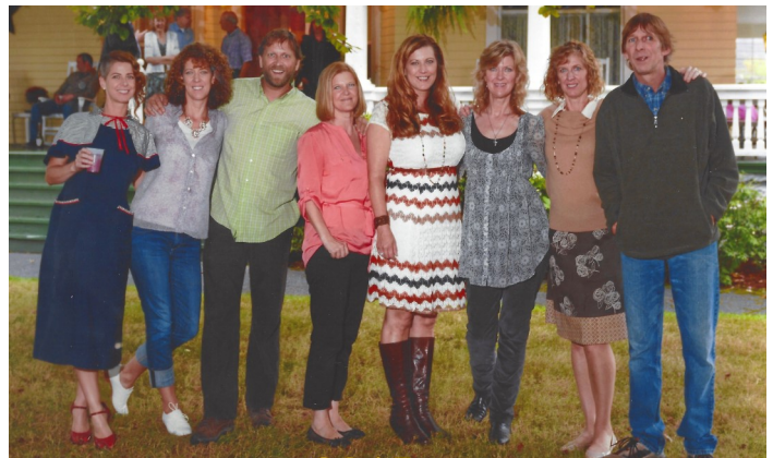
Below: The adult Dunaway children in a recent photo.

“The glory of God is man fully alive” St. Irenaeus