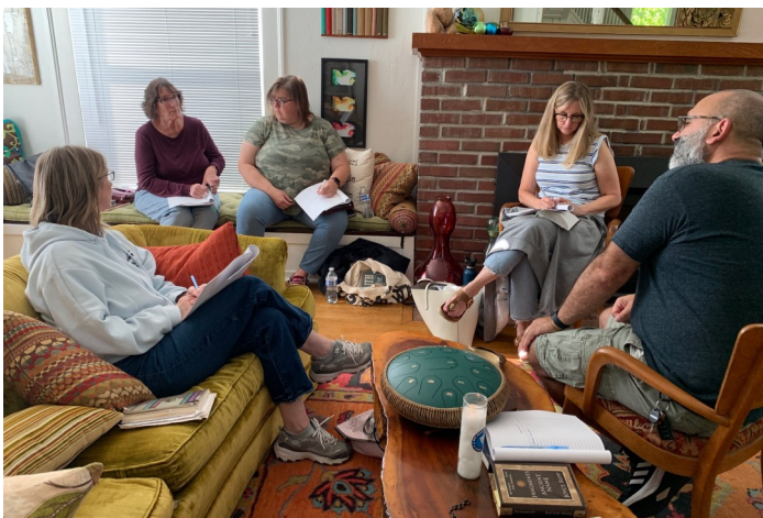
St. Mary School faculty members discuss prayer at their fall “Christ in the Classroom” retreat.