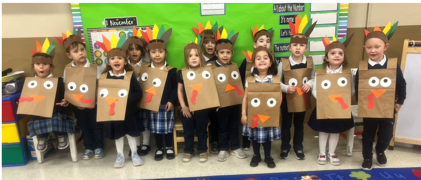
Students in the St. Mary School Preschool / Pre-K class show off their Thanksgiving art projects.

We apologize for any errors in names and/or addresses. Please send corrections or unsubscribe requests to the address above.