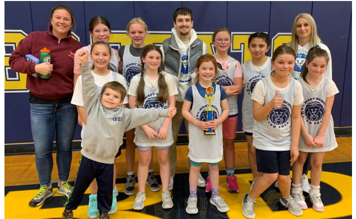
A tired but happy SMS girls basketball team after taking second place in the end-of-season tournament.

“It was my first time playing basketball and some other people’s too,” said