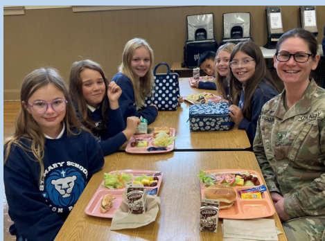
▲ St. Mary School students enjoy lunch with a member of the JBLM Quartet prior to the Veterans' Day assembly.