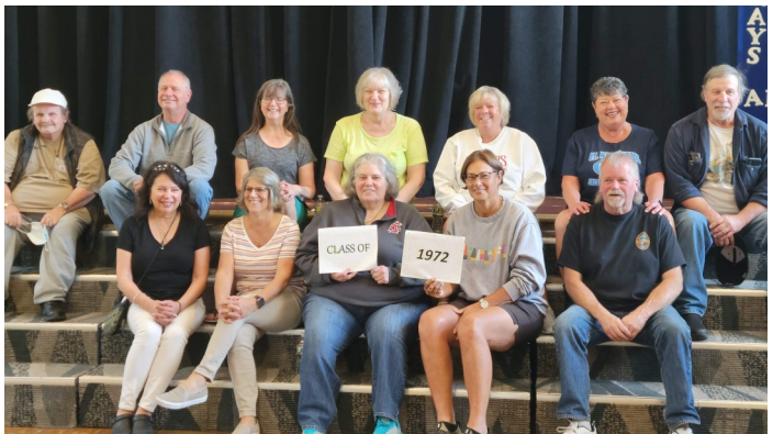
The St. Mary School class of 1972 at the time of their graduation (top) and in 2022 (bottom)

and the group responded with over $1,300 in donations.