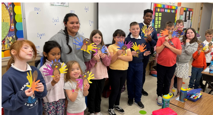
Students gathered in their school families to decorate Thanksgiving food boxes that were donated to families within the school community.