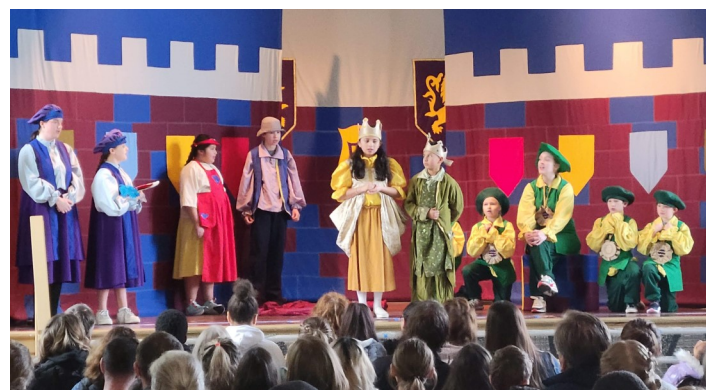
SMS students perform “The Emperor’s New Clothes”

In mid-February, two directors from the MCT travelled to the school and spent a full week leading students through the process of try-outs, rehearsals, memorizing lines, and all the elements required to stage a musical performance. Twenty-four students took on roles in the production of “The Emperor’s New Clothes” with four students working as part of the production crew. In addition, the directors held workshops throughout the week with all students in kindergarten through eighth grade to give everyone an introduction to the concepts involved with theater. At the end of the week, a full house of students, parents, and other supporters assembled in the school