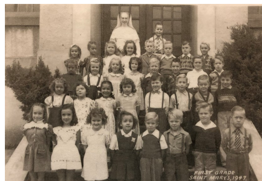
St. Mary School 1st grade class of 1947