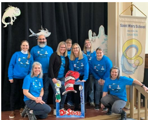
SMS faculty members prepare to welcome families at the Seusstastical Reading Night and Open House