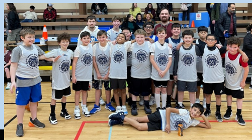
SMS Boys ► 4th—6th grade basketball team